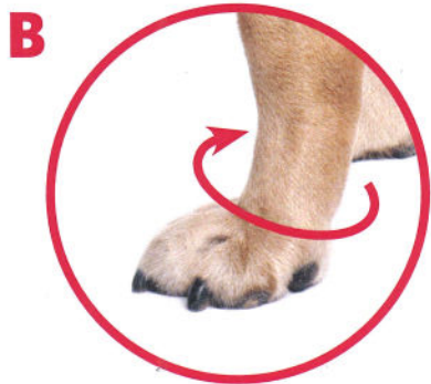
IMAGE B - Measuring circumference of metatarsal

Left foot = _____ cm Right foot = _____ cm