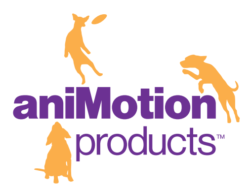
The animal mobility & fitness company

Biko Sports Bands are available in sizes 3 through 6. Sizes 1 and 2 for smaller breeds, and size 7 for Giant breeds can be made upon request at no additional costs.